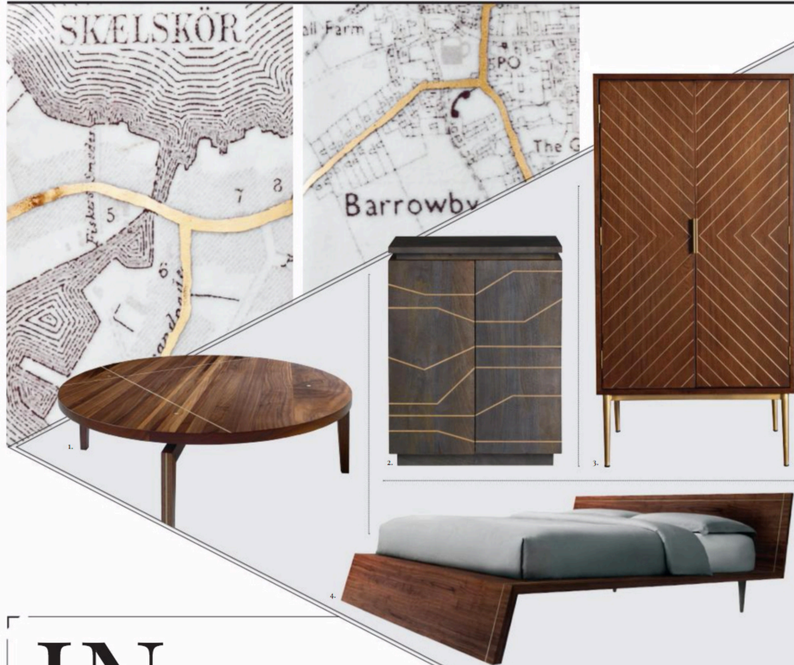
1. Dante table, price upon request, asherisraelow.com ; 2. Set on a solid plinth base, this solid mango wood cabinet features a brass line pattern across its doors. The charcoal stain further enhances this linear detailing and the modern appearance. With three removable interior shelves, the unit could easily function as a practical media unit. Brass inlay cabinet, $649, CB2.com; 3. Melrose drinks cabinet, £1,255, houseoffraser.co.uk ; 4. Furniture designer Asher Israelow is based at the Brooklyn Navy Yard. His studio specialises in original, small batch pieces. And the subtle line detail in this double bed is typical of the designer's considered approach to traditional joinery. Adrift bed, price upon request, asherisraelow.com

Award-winning ceramicist Katherine Lees produces screen printed porcelain, including these map pieces which can be customised. The delicate decoration of her handcrafted objects was inspired by items once found in cabinets of curiosities popular in the Victorian Era. Price upon request, katherineleesceramics.com