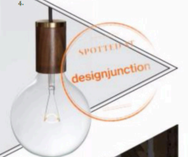
1. The Anderson furniture collection at made.com has a contemporary industrial luxe look. The brass covered recess and ultra-slim handles are the defining features of this eye-catching mango wood sideboard. Anderson sideboard in mango wood, £599, made.com ; 2. The 30mm thick top of this elegant side table is inlaid with a brass profile, the attention to detail lifting the piece and making it even more desirable. The satin finish enhances the high-end appearance. Solar side table, £795, m-dex-design.co.uk ; 3. The Beam cupboard by Dutch designer Piet Hein Eek combines raw timber and polished brass to striking effect, taking on the appearance of a stack of beams on a plinth. £20,660, scp.co.uk ; 4. Oak Knuckle pendant, £100, talaed.com